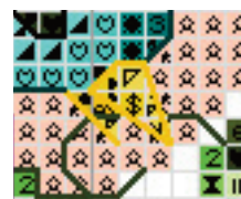
Close up of beak area

Make French Knot on bird's eye with 1 strand of DMC white