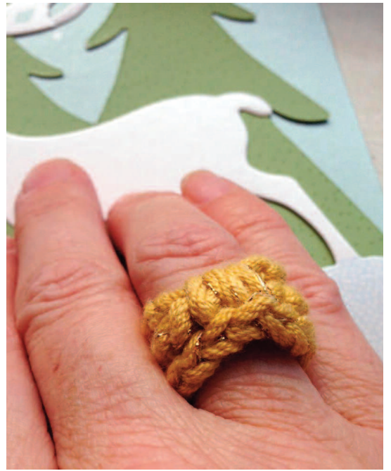
Two options for finishing