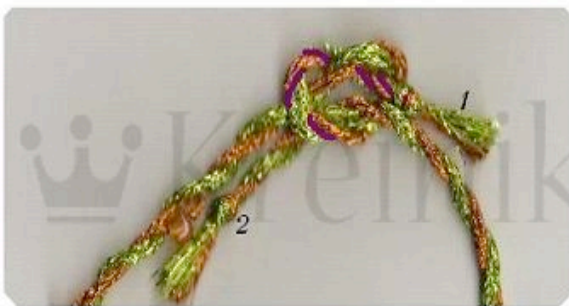
Bring cord end #1 behind the loop and through.