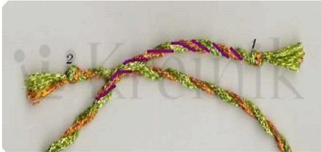
Lay #1 cord end over the top of #2