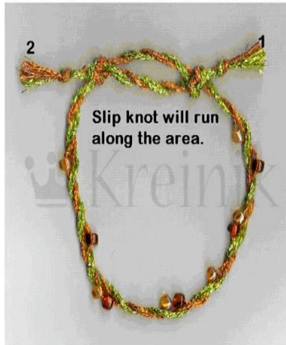
Slip knot will run along the area.

Slip bracelet on wrist, to adjust: Press and hold #1 knot against palm, pull #2 end with other hand.