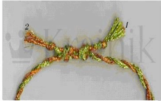
Cinch knots, evenly space from one knot end to the other.