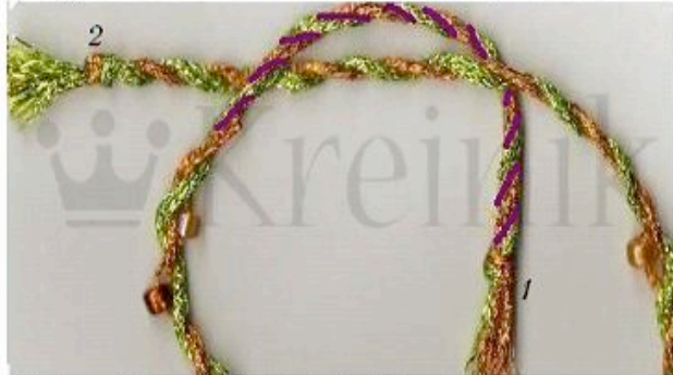
Bring #1 cord end behind #2