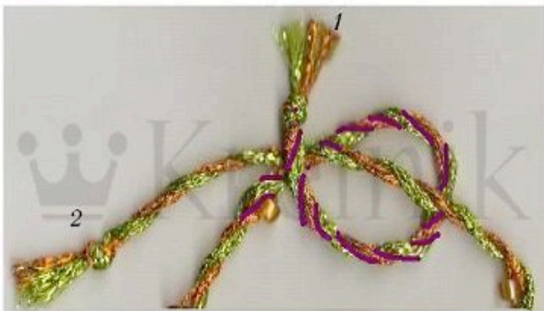
Bring cord end #1 up and on top of #2