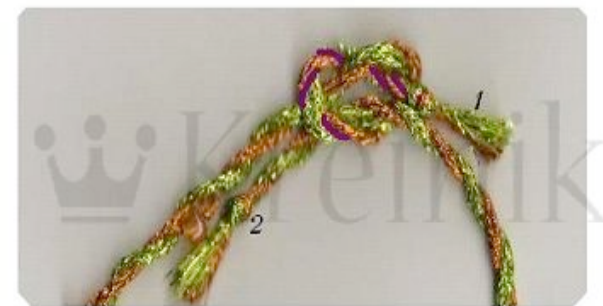
Bring cord end #1 behind the loop and through.