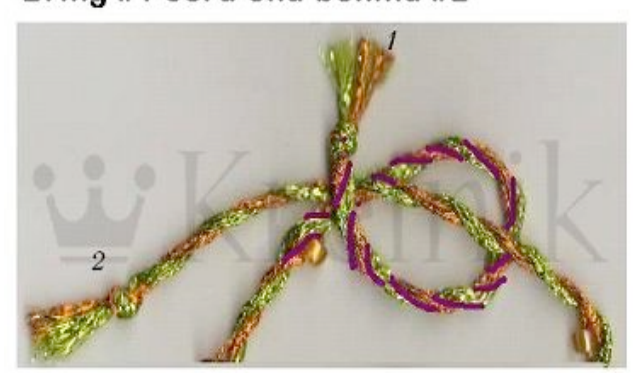
Bring cord end #1 up and on top of #2