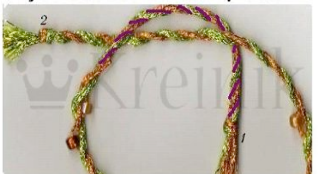
Bring #1 cord end behind #2