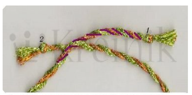
Lay #1 cord end over the top of #2