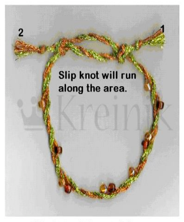
Slip bracelet on wrist, to adjust: Press and hold #1 knot against palm, pull #2 end with other hand. Have Fun! Make some for Friends and Family!